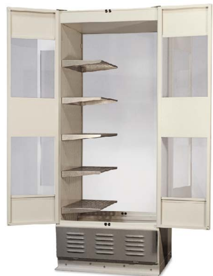
Model 340 Configuration with Half-Width Shelving Option