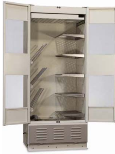
Model 330 with Half-Width Shelving and Bag & Bottle Rack Options