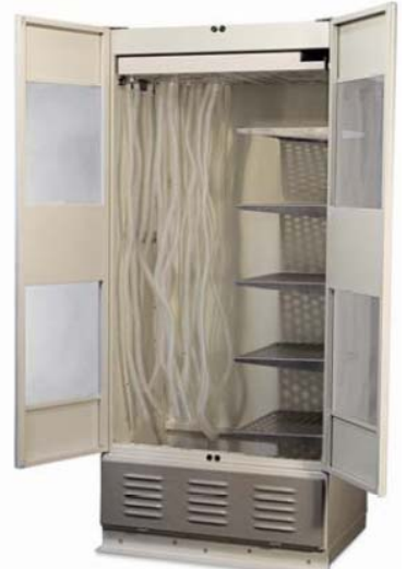
Model 330 with Half-Width Shelving and Bag & Bottle Rack Options