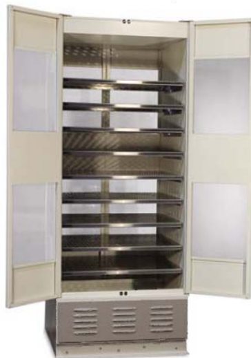
Model 340 with Maximum Full-Width Shelving Option