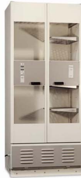
Model 330 Configuration with Half-Width Shelving Option

Two year warranty covers 100% of parts and labor, with an optional 5-year Extended Warranty Plan (parts only) available. Toll-free technical assistance for the lifetime of the equipment. Warranty service is provided through Medical Equipment Repair Association (MERA) or through in-house biomedical staff.