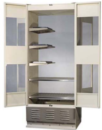
Model 340 with Half-Width & Full-Width Shelving Option and Small Parts Trays Options