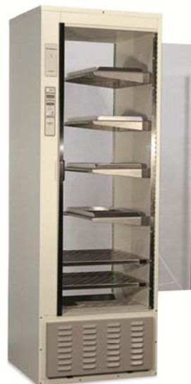
Model 136 with Half-Width & Full-Width Shelving and Small Parts Trays Options