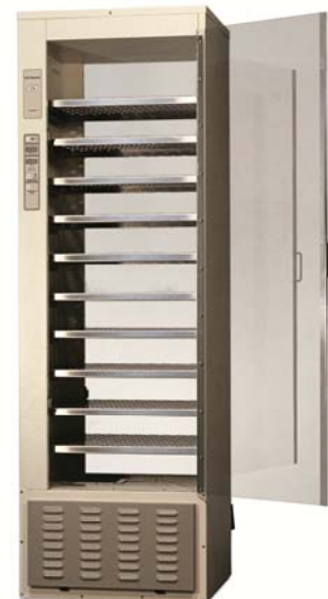
Model 136 with Maximum Full-Width Shelving Option