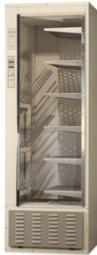
Model 135 with Half-Width Shelving and Bag & Bottle Rack Options