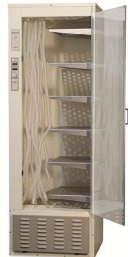
Model 135 with Half-Width Shelving and Tube Drying Rack Options